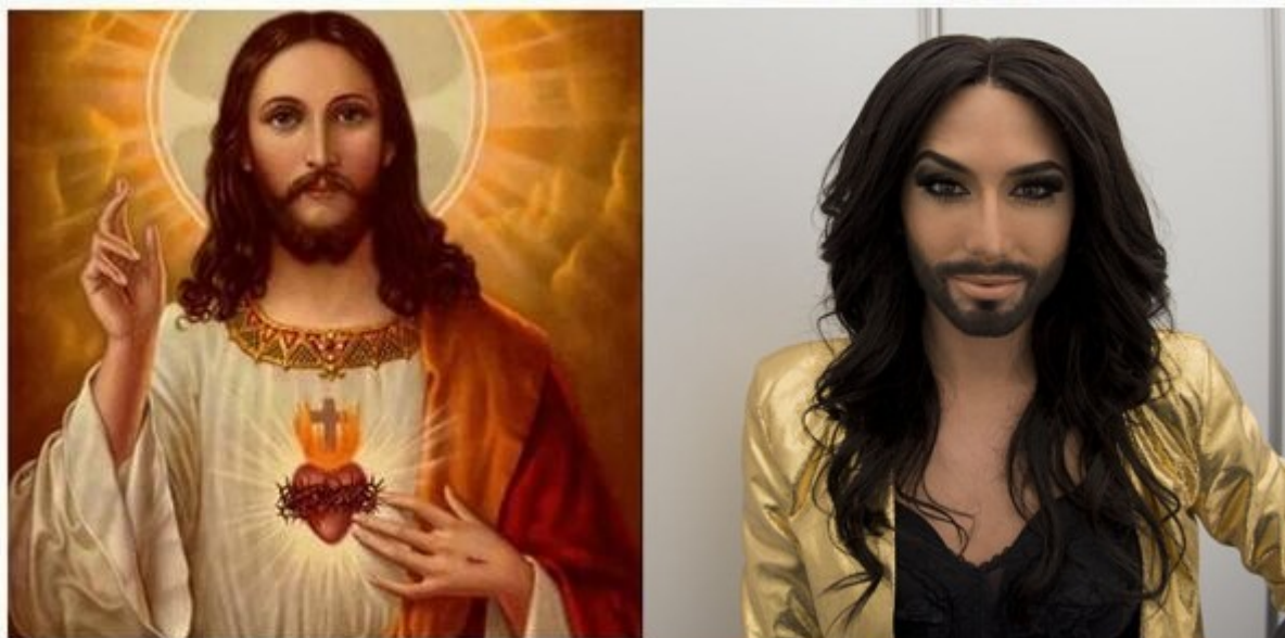
Jesus and Conchita Wurst at a Meet & Greet during the Eurovision Song Contest 2014. Albin Olsson (2014). CC BY-SA 3.0. Wikimedia Commons.

all right. It was only then that they learned about the fireworks accident. Fourteen years later, Ilse Delange sang in the 2014 Eurovision Song Contest herself with Waylon as The Common Linnets. They came in second place after Conchita Wurst, a transgender Jesus look-alike. That is noteworthy, not only because it links DeLange to Jesus but also because early Christians performed a sex change on God in their scriptures.