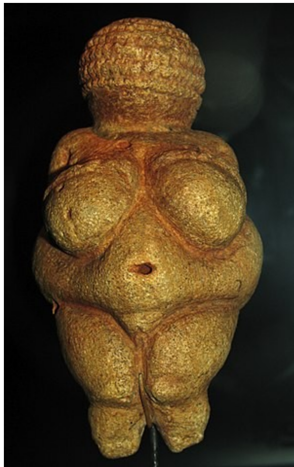
Venus of Willendorf.

In archaeological excavations, female figurines have turned up. They could depict mother goddesses. The most famous example is the Venus of Willendorf, dating back to around 23,000 BC. In ancient cultures, mother goddesses represented fertility. The ability of women to produce offspring could have been the essence of Mother Goddess worship. Women give birth, and early humans may not have understood that men were the fathers. They may have thought men had no reproductive use and existed to please the women. Consequently, the Mother Goddess can give birth as a virgin, which is the miracle of the Mother Goddess. One of the best-known Mother Goddesses was Isis.