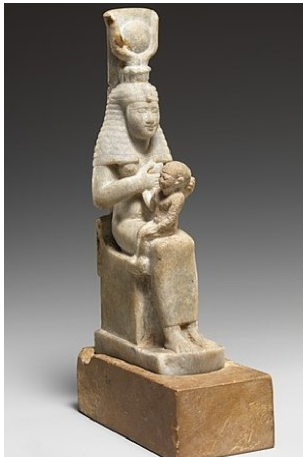
Isis with Horus.

Jesus' birth mother, Mary, plays a prominent role in Christianity. As the story goes, she was a virgin who birthed Jesus. She is the central figure in Roman Catholicism and Eastern Orthodox Christianity. She is the Mother of God, Church tradition holds, thereby implying Jesus was God and that God has a mother, which is indeed highly peculiar. Many Catholics pray to Mary rather than to Jesus or God. In this way, Mary is a proxy for God. The Quran consistently names Jesus the son of Mary rather than the Son of God. The images of Mary with the child resemble those of the Mother Goddess. They picture Jesus as the Son of God, the Mother. That is most noteworthy because Jesus believed he was Adam, the Son of Eve, the Son of God. How could this happen? Inquiring minds want to know. Now, there is the historical explanation, and there is the script that God wrote.