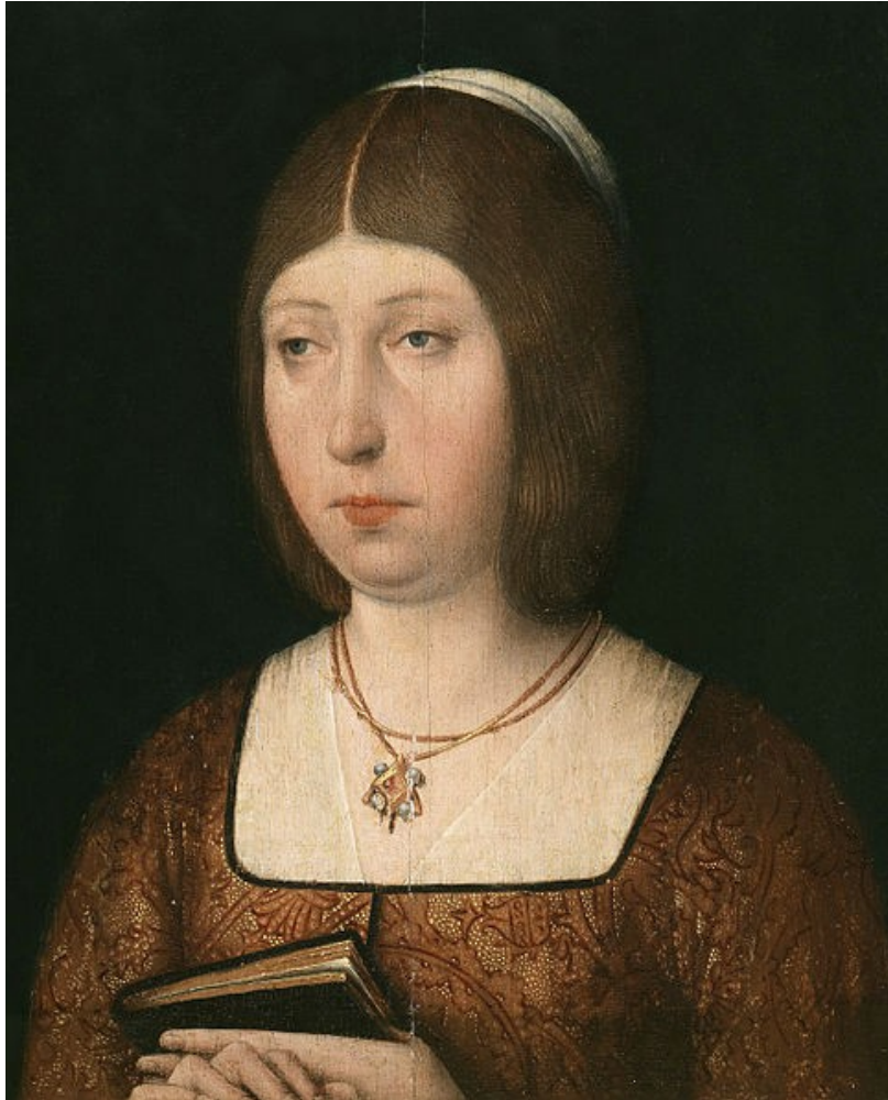
Isabella I of Castile. Public Domain.