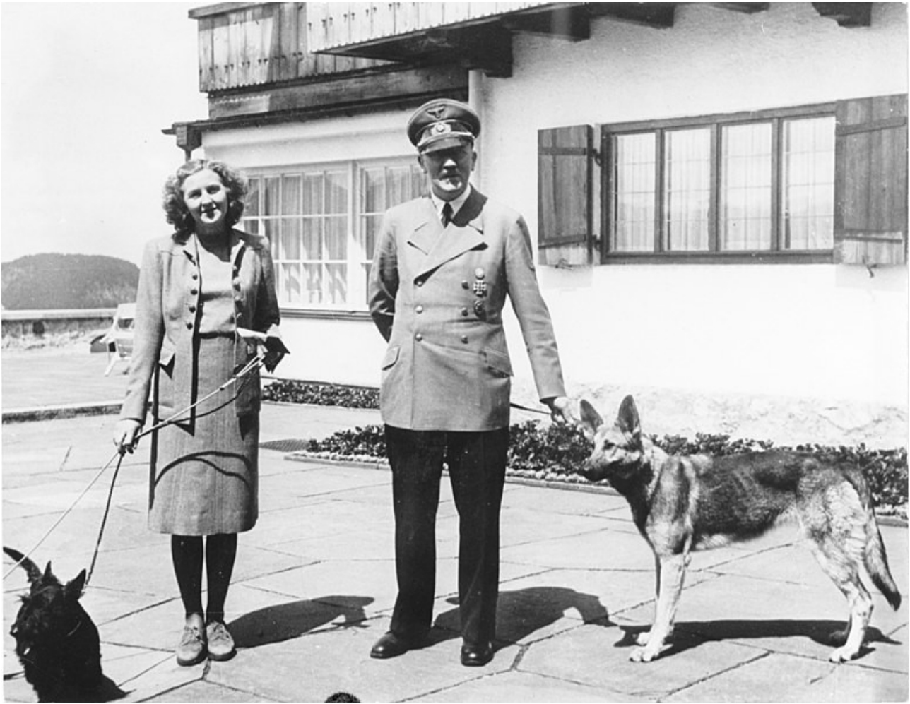
Eva Braun and Adolf Hitler.