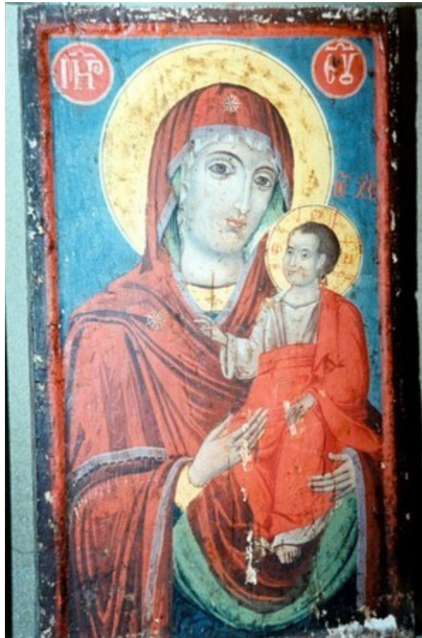
Saint Mary Bolnichka Icon.

In the early years of Christianity, there was no cult of the Virgin Mary. The earliest Christian paintings, made around 235 AD, depict Christ, Peter, and martyrs, but not Mary. The first solid evidence of devotion to the Virgin Mary dates back to the third century, but its origin remains unclear. Perhaps, early Christians prayed to Mary as they did to other saints. Possibly, Mary granted the most requests, which made her increasingly popular. In this sneaky manner, the Mother Goddess sneaked into the Church through a back door, via the cult of the Virgin Mary. The ability to give birth without the need of a man is the miracle of the Mother Goddess. Christians later created statues and icons of the Virgin with the child Jesus, looking like the Egyptian mother goddess Isis with her child Horus.