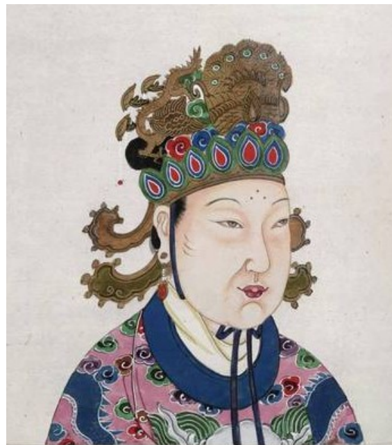
18th century portrait of Empress Wu (Wu Zetian). Public Domain.

That could be sixth-century gossip, but perhaps the almighty Owner of the magnificent city of Constantinople and the rest of the universe desired to be reminded of Her greatness before She went into the desolate Arab desert as Khadijah to go after Muhammad.