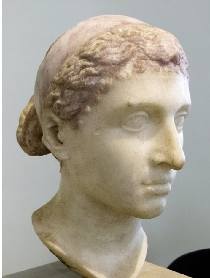
Roman sculpture of Cleopatra wearing a royal diadem. Altes Museum in Germany.

When my son was nine, he jokingly referred to himself as the Emperor of China. He often ordered my wife and me. We were making a joke out of it and called him the king. Still, my son insisted he was the Emperor of China. 'The Emperor of China demands cheese,' he then added. An article about the first emperor of China appeared in a television magazine shortly after I found out we live in a virtual reality.