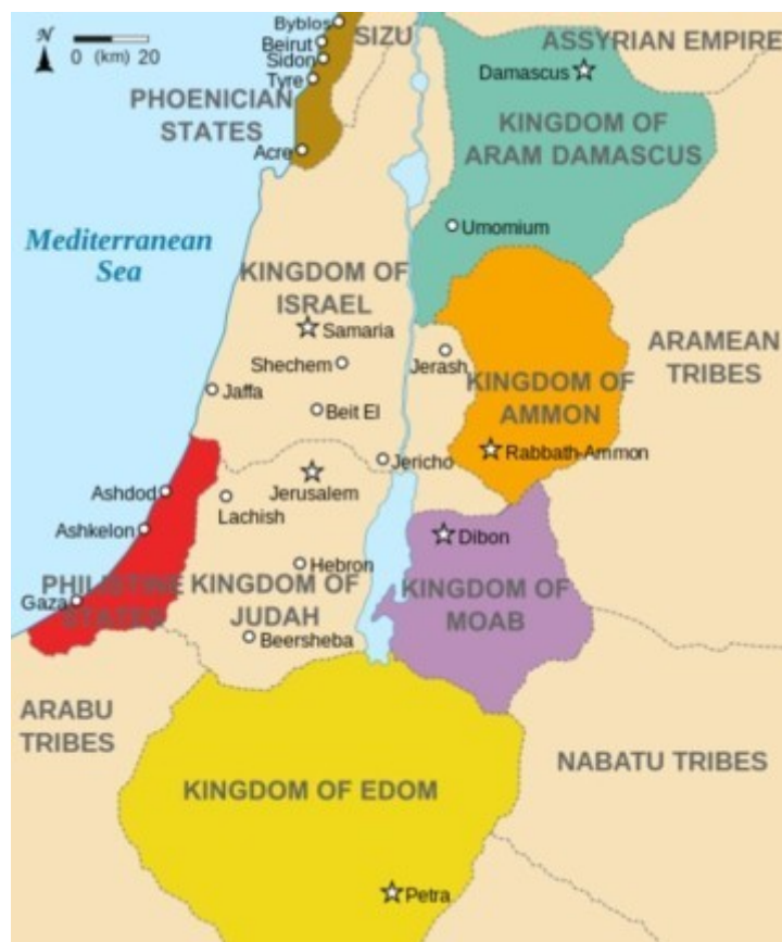
Kingdoms of Canaan.

They were the parents of the other Canaanite deities, Baal, Anat, Yahweh, and Yam. Asherah is Yahweh's mother and El his father. El was often depicted as a bull and was also known as Shor-El, the bull god. And so, we have the highly peculiar situation that half the world's population now worships one of the children of El and Asherah, two deities of an insignificant tribe living somewhere between the more advanced civilisations of Egypt and Mesopotamia 3,000 years ago, as the supreme God who rules the entire universe. That might have been a hilarious observation if people hadn't been murdering each other in the millions for their delusions.